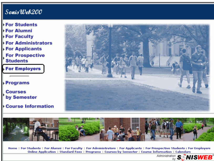
• Figure 1 For Employers Link