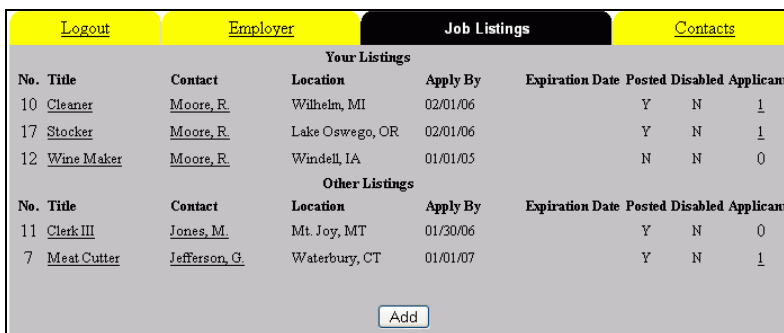
• Figure 4 Job Listings